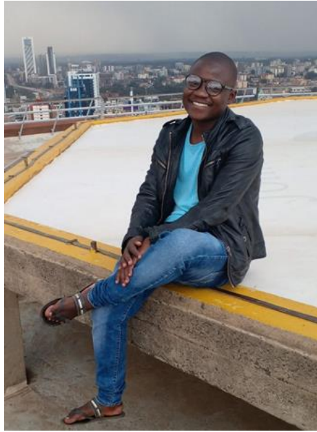
Aerial oblique of Nairobi City

Thank you DAAD-Stiftung for your dedicated support. I will not let you down.