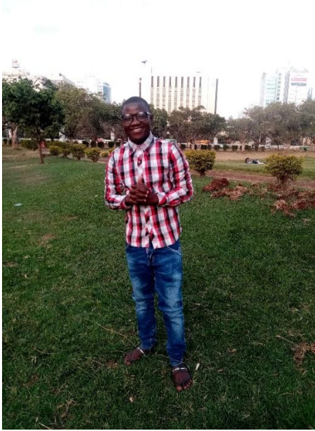
At Uhuru Park Nairobi